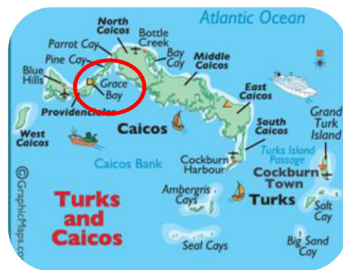
Located at Grace Bay